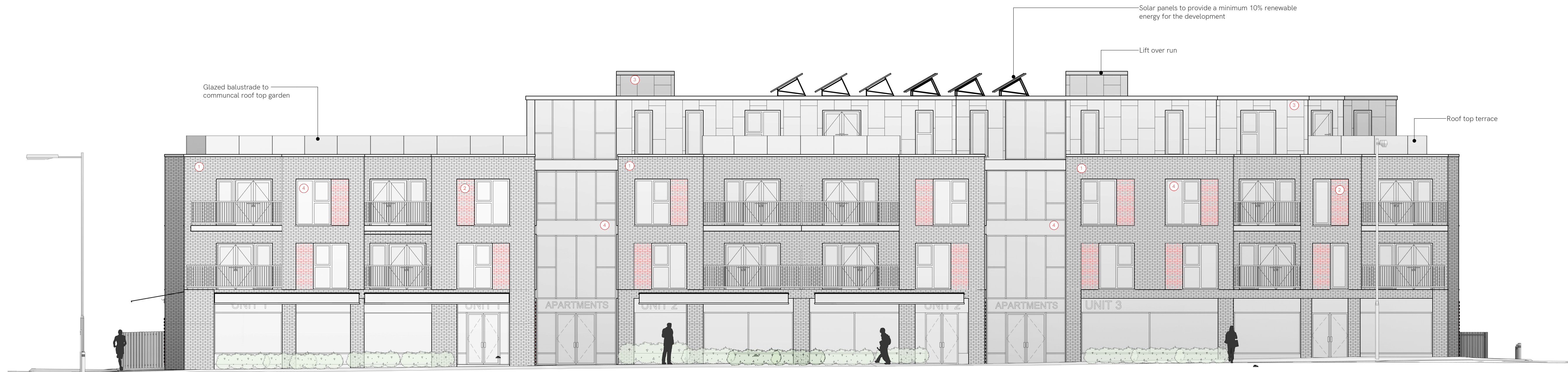
1 Proposed Front Elevation - East 1 : 100