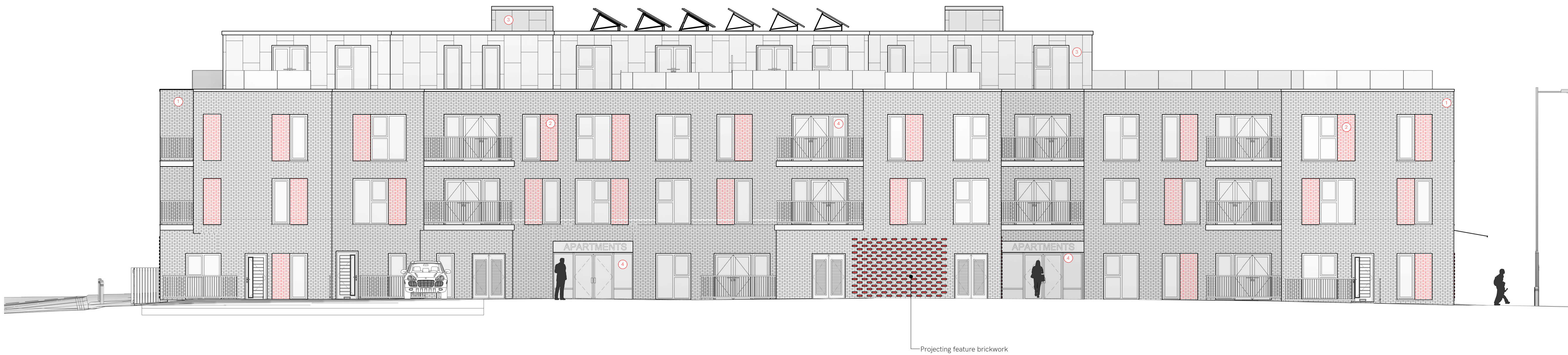
2 Proposed Rear Elevation - West 1 : 100